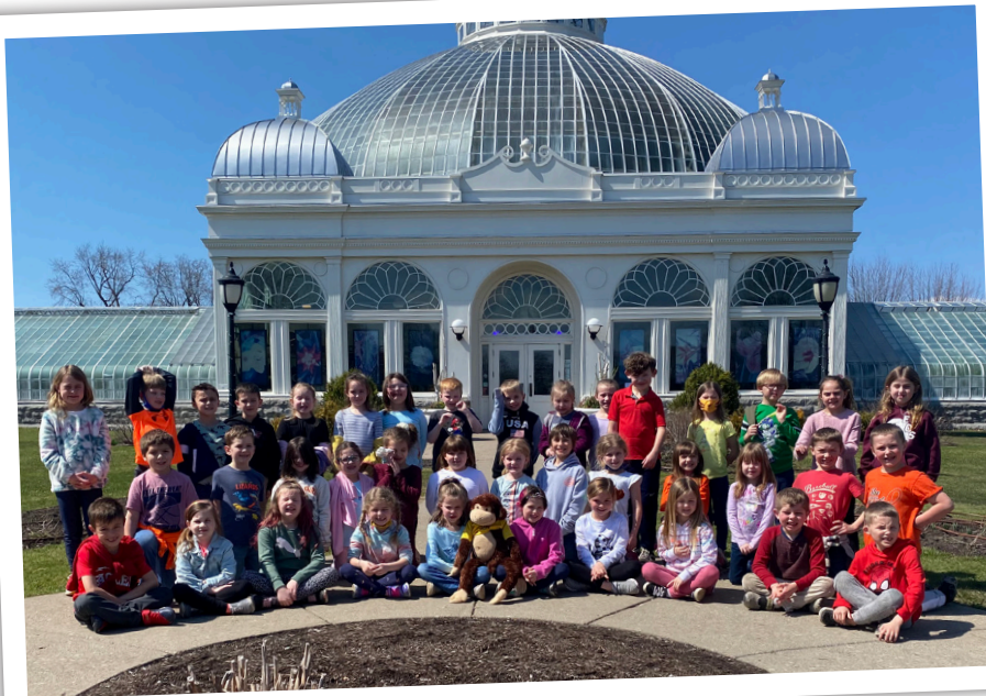
First Graders Made the Trip to the Buffalo & Erie Co Botanical Gardens A Beautiful Day to See Some Amazing Plants and Flowers!